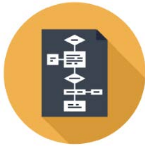
New clinical model