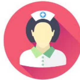
Wellness coaching with RN support