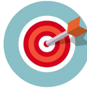
Targets the 5% (3+ hosp/ED use)